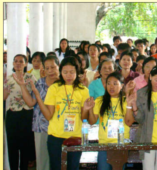
Regional youth coordinators in yellow savor the prayer